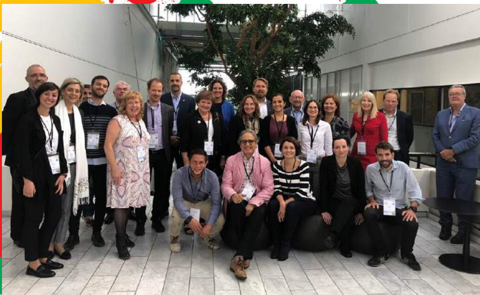
Group Photo of the participants to the Advisory Board Meeting of the European Transplant Patients Organization - Copenhagen, 14 September 2019